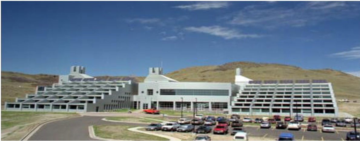
Figure 1. Solar Energy Research Facility

Completed in 1993, the 10,800 m 2 (115,200 ft 2 ) SERF houses highly specialized laboratory facilities along with typical commercial office building spaces (Figure 1). To meet the energy-efficiency goals, the design team carefully considered geometric organization and system zoning during the conceptual design phase. These issues must be considered in the earliest stages of conceptual design and are essential to creating a low-energy building. For the SERF, this planning ensured that the building's architecture improved the building's energy performance and responded appropriately to the south sloping site.