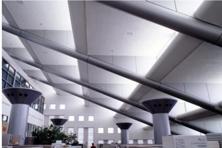
Figure 2. Stepped Clerestory Shelves for High-Quality Daylighting

the lights off when spaces are not occupied. These systems reduce both lighting electricity use and cooling loads.