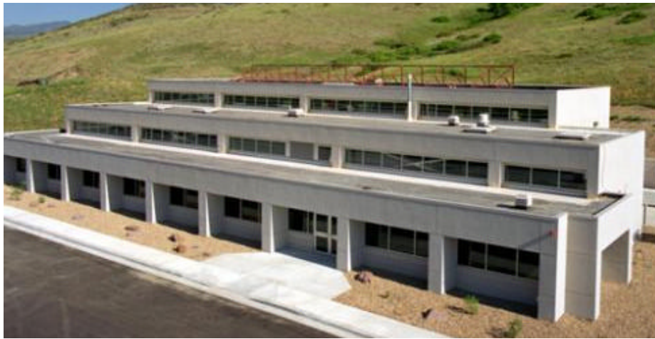
Figure 3. Thermal Test Facility

When researchers began designing the TTF (Figure 3) in 1994, they took a strong approach to the whole-building design process. The first strategy researchers employed for the 929 m 2 (10,000 ft 2 ) facility was to establish a clear goal of 70% energy cost reduction from a code-compliant building at the onset of the conceptual design process. Designers then began optimizing the building design with detailed evaluations, using hourly simulation tools.