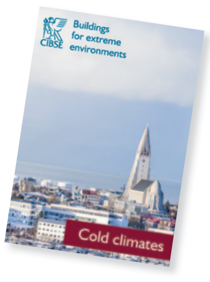
CIBSE Buildings for extreme environments.

Working through the Society of Light and Lighting (SLL), CIBSE publishes guidance on lighting. In 2017 several new titles were published for SLL, including guidance on lighting of stairs, the location of the largest single category of serious accidents in homes. CIBSE also published guidance on overheating in homes, another increasingly topical issue.