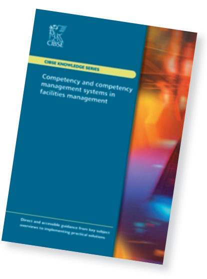
KS21 Competency and competency management systems in facilities management.

CIBSE members continue to benefit from online access to both journals as a benefit of their membership.