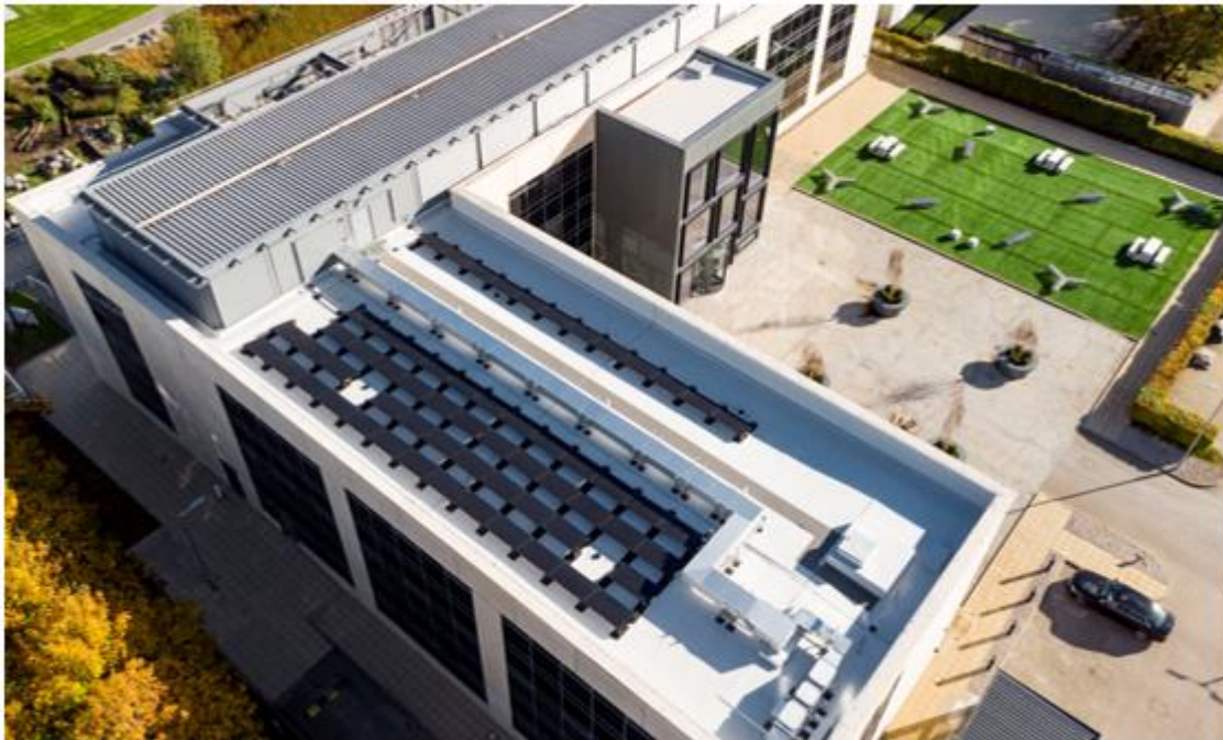
Figure 2 – Example photograph (use style: caption)