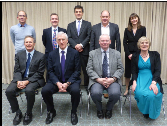
The Lifts Group Executive 2016