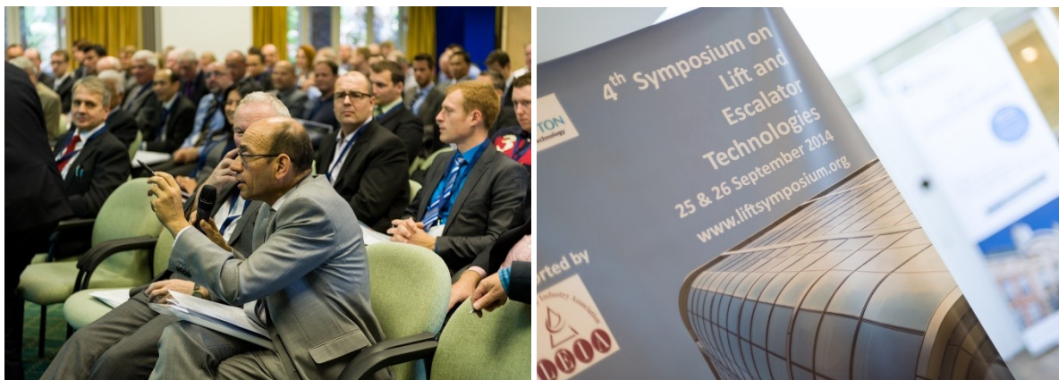
Lift (US: Elevator) Traffic Analysis & Simulation Open Forum, September 2014

The highly popular Symposium on Lift & Escalator Technologies was held in partnership with the University of Northampton, 25 - 26 September 2014. Two days of peer reviewed technical papers were presented to an international audience of over 100 attendees. Proceedings are available to download from www.liftsymposium.org (past events tab).