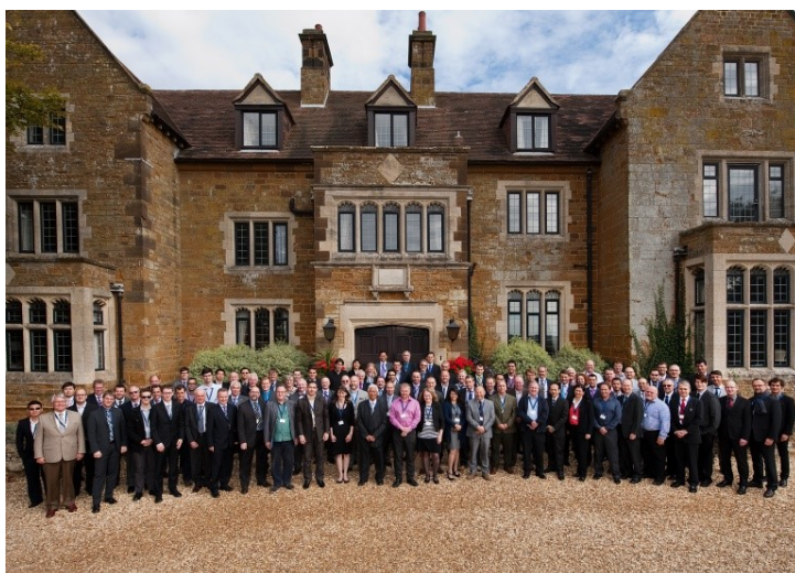
Delegates of Lift (US: Elevator) Traffic Analysis & Simulation Open Forum, September 2014