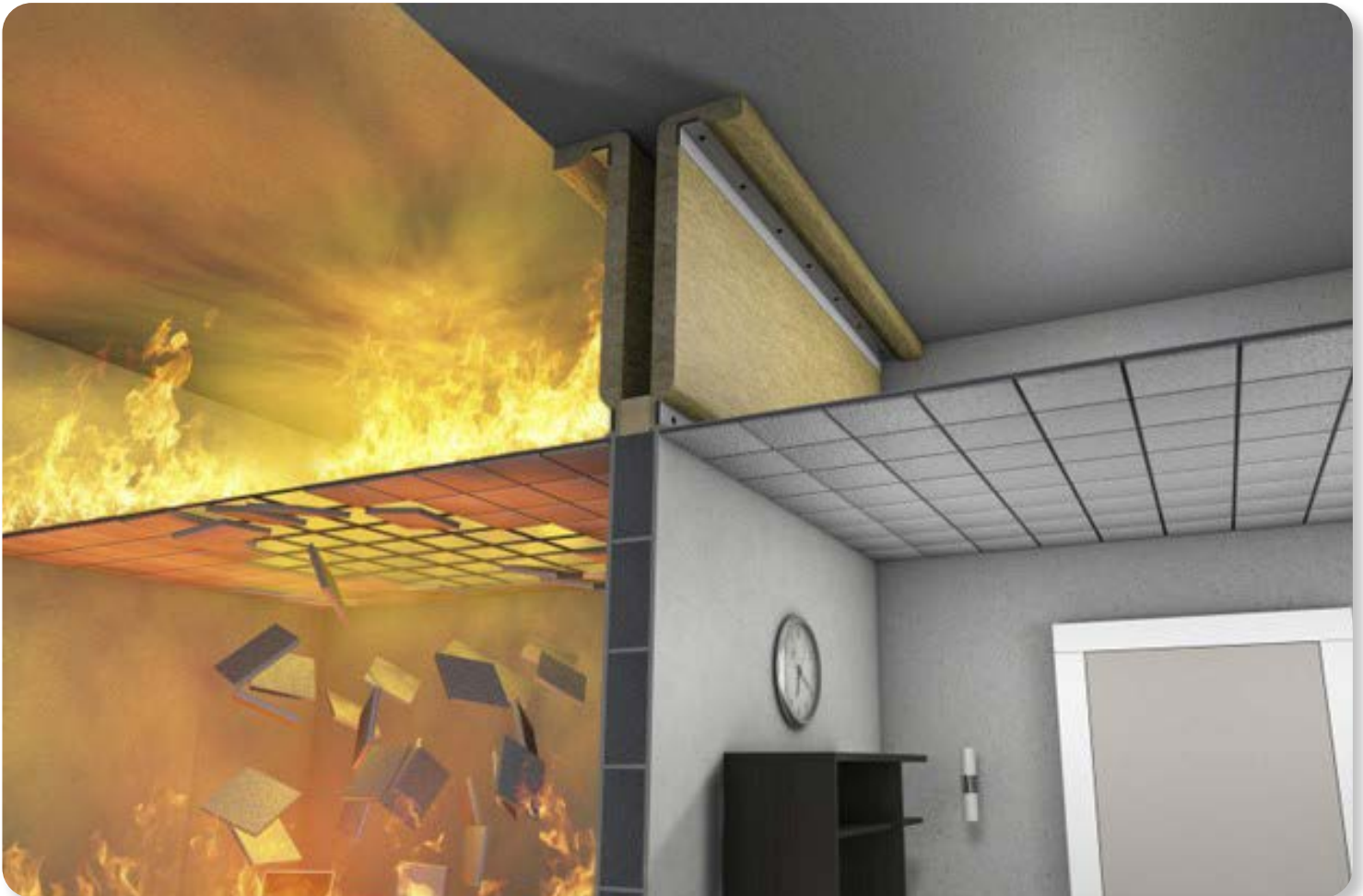
Image from The Regs: How to make buildings fire-safe with cavity barriers