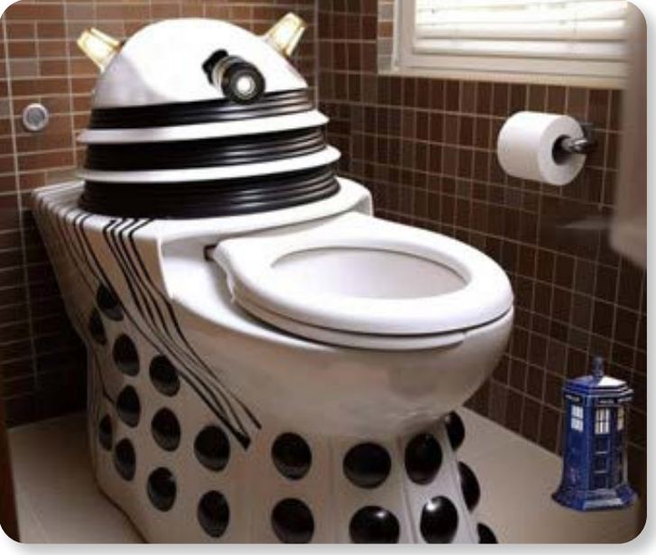
Whilst scrolling through Facebook I came across these and had to laugh!